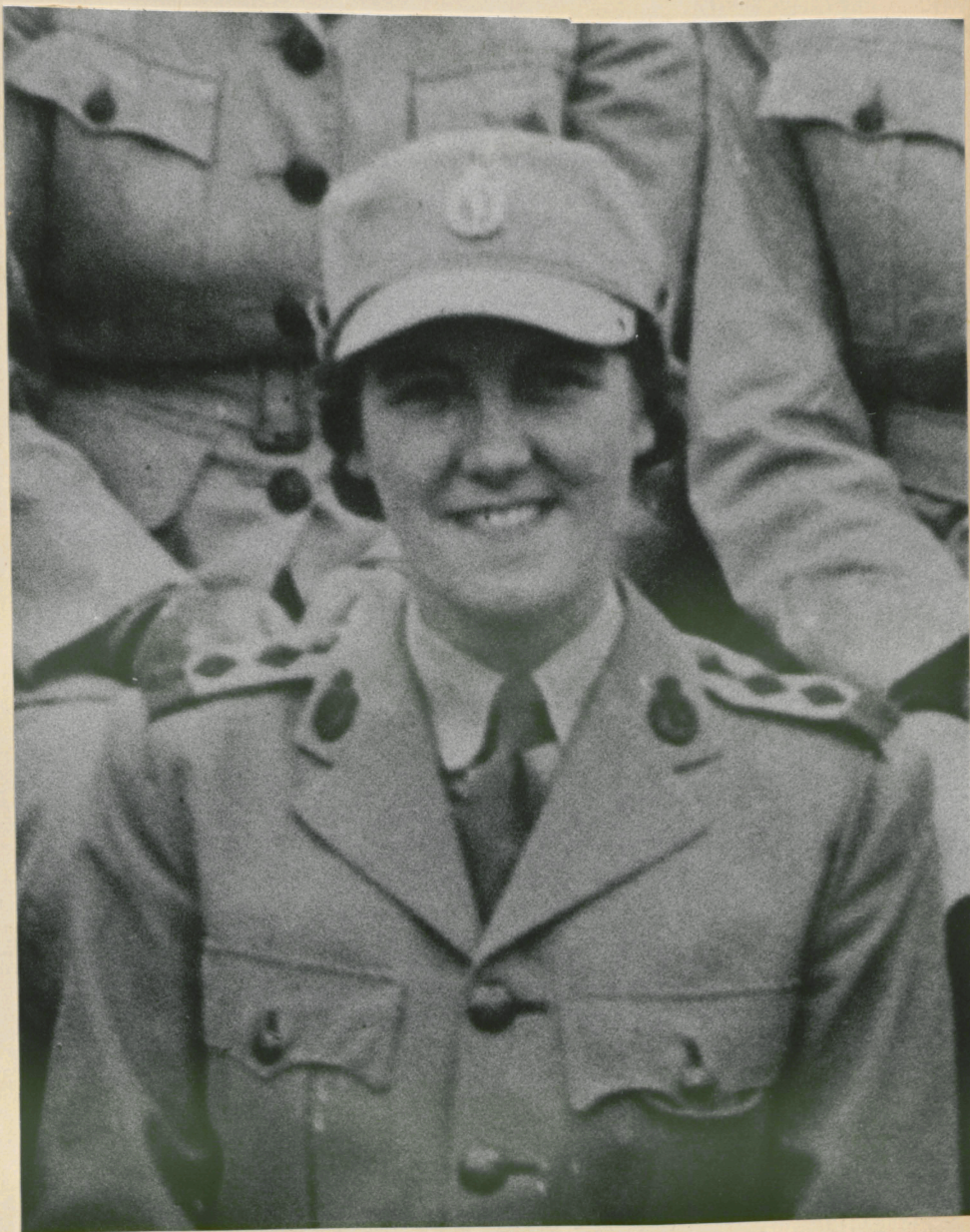
MAJOR (MISS) BLUE.