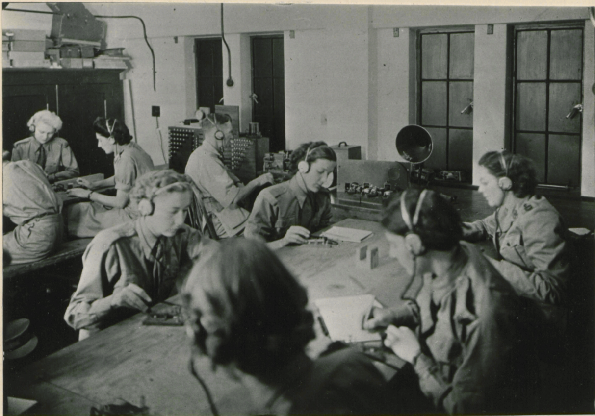
W. A. A. S. UNDERGOING MORSE TRAINING.