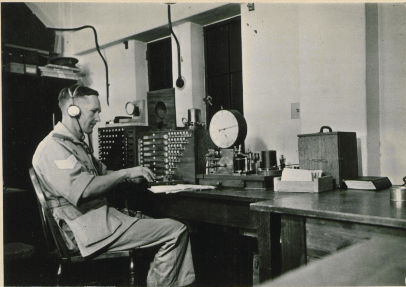
MORSE TRAINING INSTRUCTOR AT THE CONTROL BOARD.