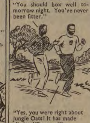
"Yes, you were right about Jungle Oats! It has made all the difference!"

If you eat a good breakfast in the morning, you won't get quickly tired in the afternoon. Eat Jungle Oats for breakfast. It is ideal for both young and old. It makes