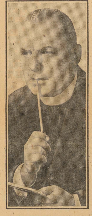
Fighting Father Dunne.

Thu-Sat April 24-26 FIGHTING FATHER DUNNE