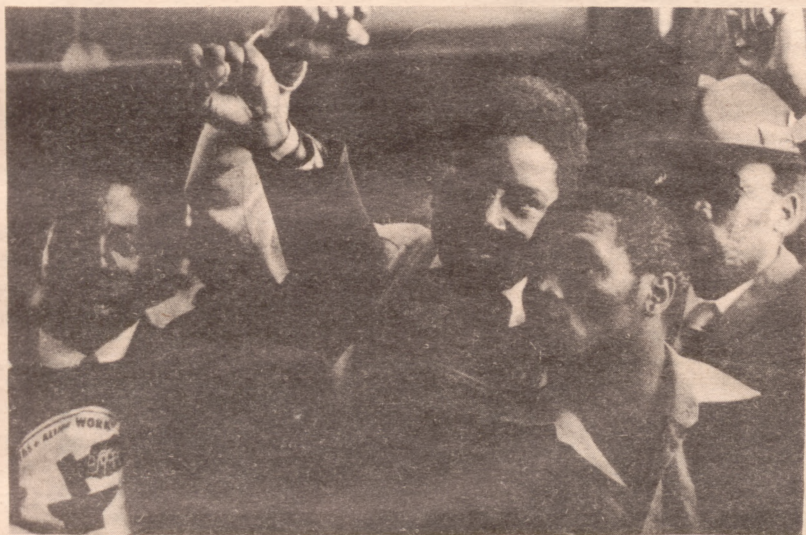
Amalunga e—MAWU emhlanganweni wawo kawonkewonke ngo—August