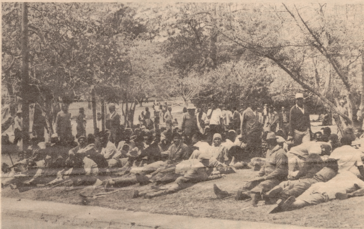
Izinkinga zempesheni muva nje kwa-Huletts e-Mt. Edgecombe

* Uma bethola imali yempesheni enkampanini, balahlekelwa yilungelo loku-thola eka Hulumeni.