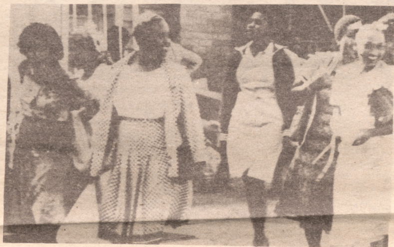
Abateleki e-TMSA ..... kuthinteka ubudlelwane kwezemisebenzi ed endaweni yonke yase-Springs.

Olunye uhlobo olwehlukile lwemali ekhokhelwa abaseb- enzi abadiliziwe NUMARWOSA yaxoxisanan ngalo nezinkampani zezimoto e Port Elizabeth abasebenzi nabaQashi kulamafekhtri bayokhokha kulesikhwama imali eyosetshenziswa abasebenzi ngezikhathi zama short-time. Okwamanje lesi- sikhwama esaqala ngo 1978, abangu R400, 000.