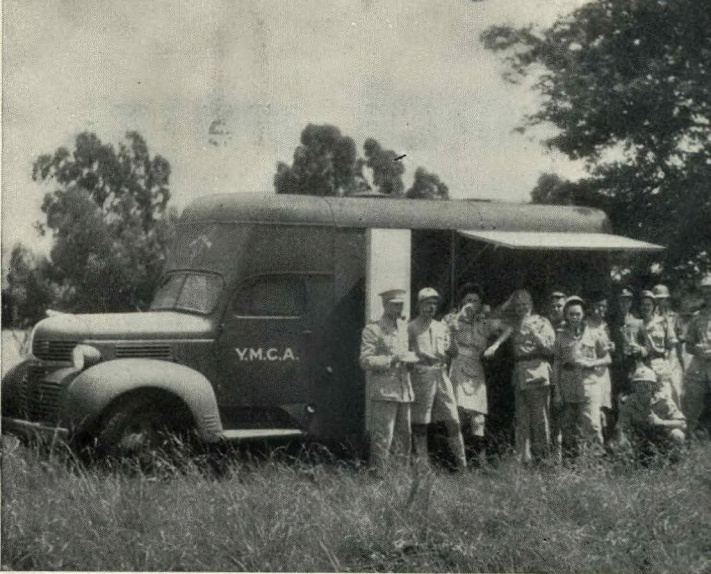
Y.M.C.A. Mobile Canteen "Up North"