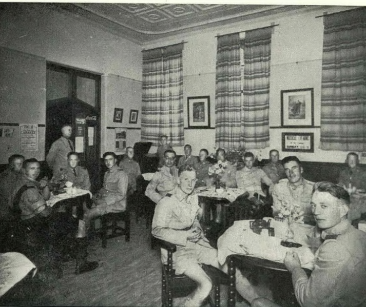
Dining-room in one of the Talbot Houses

The work of the Y.M.C.A. started in December, 1939, with a temporary "Hut" in the Potchefstroom Camp. At the end of November, 1940, after only one year's operation, Y.M.C.A. activities had been tremendously expanded. This expansion has been greatly assisted by the generous and enthusiastic response of many women voluntary workers throughout the Union.