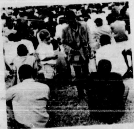
Children from the neighbouring areas seen distributing Black armbands for the occasion. This predominantly large Black audience showed their whole-hearted support for what the speakers said and proved that they were re- ady to commit themselves to their own salvation by un- animously accepting a resolution that encouraged Black People's Convention to establish a branch in Natal.

In the evening the normal evening prayer was changed to a Heroes' Day Service. Here students commended before God our Black Heroes and gave thanks to their love for mankind in their fearless struggle against the monstrous "white racism".