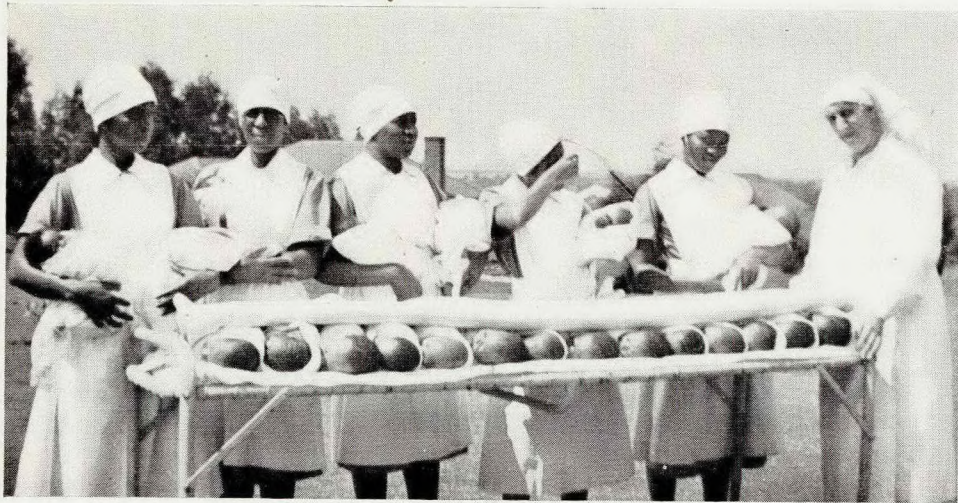
PEAS IN A POD