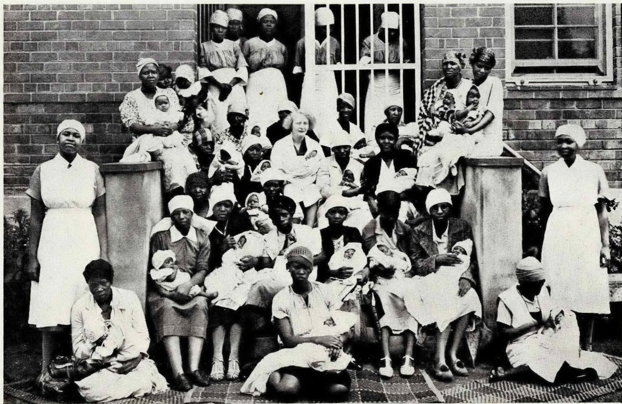
OUR DOCTOR AND HER BRIDGMAN BABIES