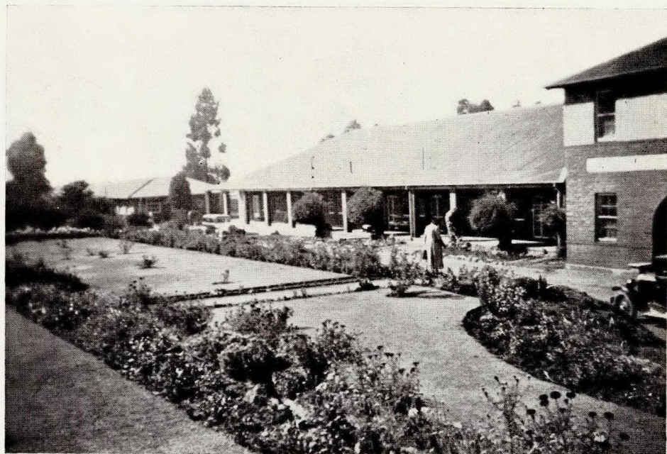
BRIDGMAN MEMORIAL HOSPITAL