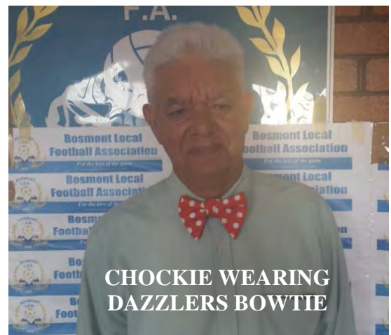
CHOCKIE WEARING DAZZLERS BOWTIE