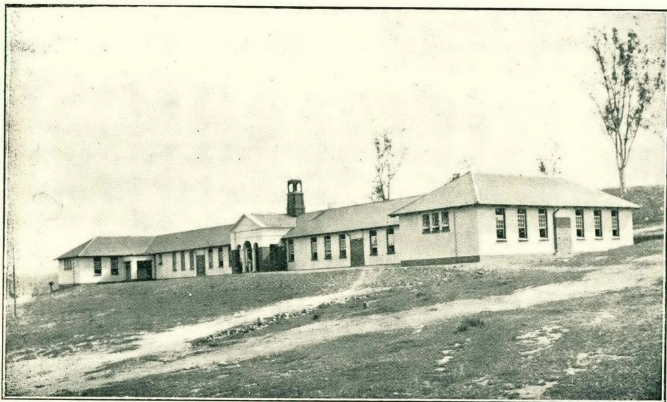
The Practising School