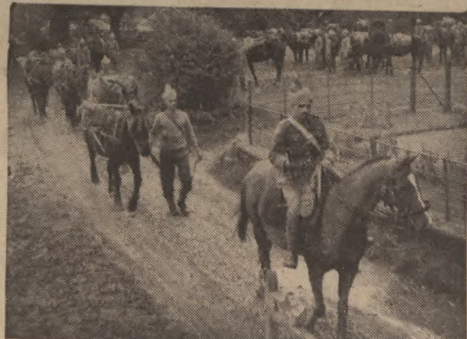
Indian soldiers fought side by side with soldiers from Britain and the Dominions in East Africa, Abyssinia and North Africa, and they are now fighting in Italy. They stand guard on the borders of India itself.

The United States Government has been informed of the arrangement between Britain and Portugal for the use by Britain of facilities in the Azores, and has approved of it, says a State Department announcement made in Washington on Tuesday night.