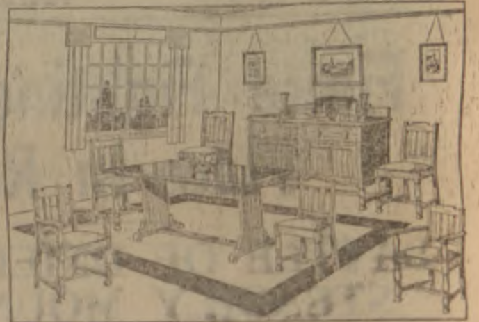
The "MONTAGU" Dining Room Suite, comprising 4 ft. Sideboard, 4 ft. by 2 ft. 6 in. Refectory Table, 4 small and 2 Arm Chairs fitted with loose panel seats.

MONTHLY FOR THIS MODERN DINING-ROOM SUITE