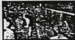
Increased transport costs - part of a growing burden

Most manufacturers buy their own materials and equipment with borrowed money, and hope to pay it back out of profits. Interest rates of 23 percent are discouraging investment and very little money is going into making the economy grow.