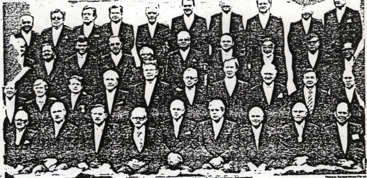
Published by the South African Students Press Union, 9 de Lauro Street, Braamfontein, Johannesburg

If anything, the silence over the past month from those participating in the apartheid structures further proves that the point made by the massive boycott of the polls in August was correct.