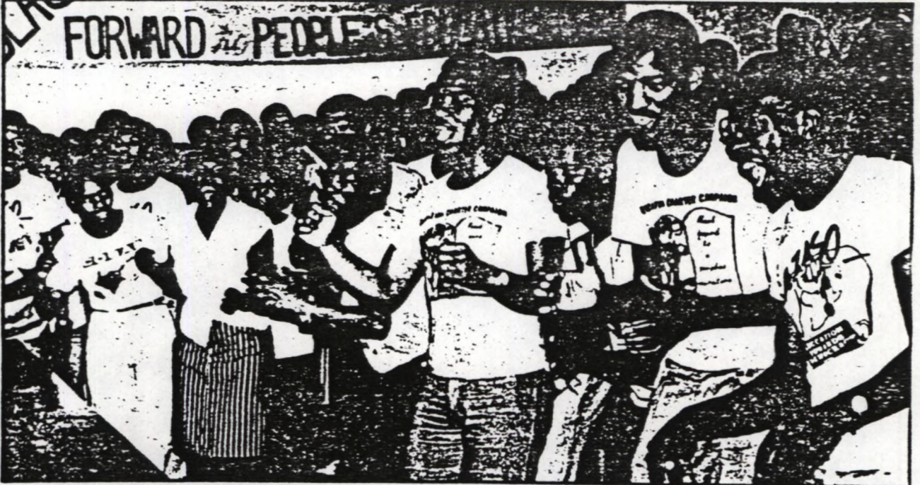
The Education Charter campaign aims to gather in the educational demands of students, workers and communities across the country. Eastern Cape students give it an enthusiastic launch