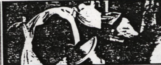
Using water against teargas fired during PE rent protests

Organisers who went door to door said the issue has sparked a high level of awareness, not only of the consulate issue but also of detentions in general.