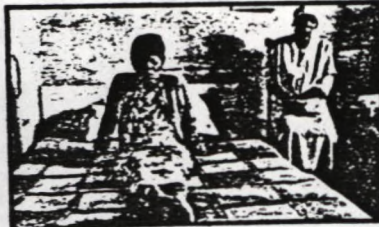
African pensioners fight long queues, tough laws and uncaring officials. All for R65 a month or less

They either judge by appearance or by questioning people about important events like the Bambatha Rebellion (1906) or the Great Flu (1918). One woman in Natal was told she was too young to get a pension, and the pension clerk wrote "born 1922" in her reference book. But she