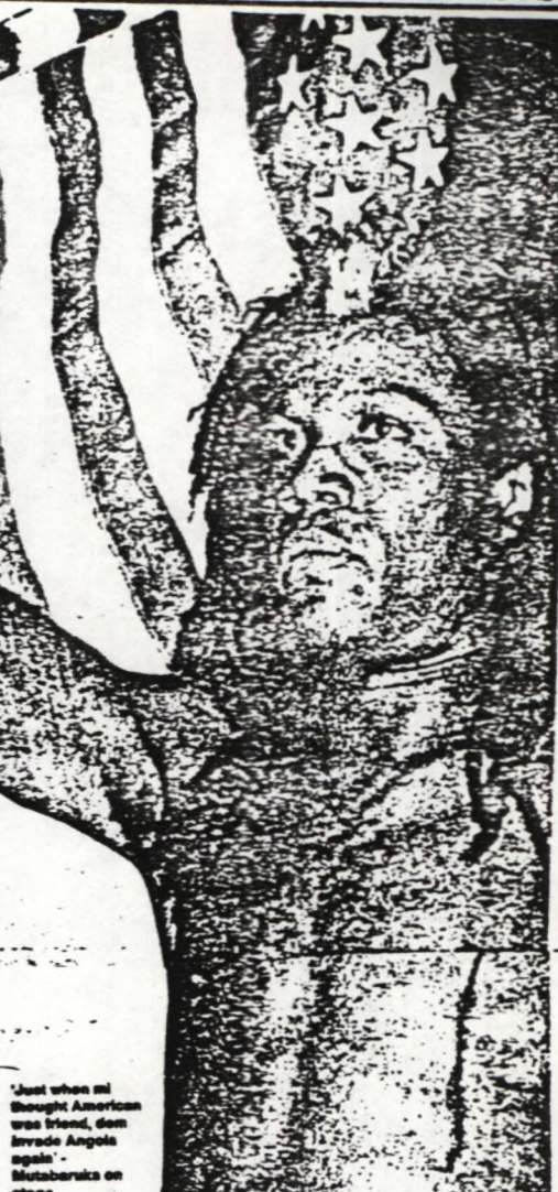
'Just when mi thought America was friend, dem invade Angola again' - Mutabaruka on stage

In a piece called 'set di prisoners free', Mutabaruka asks why it is that people are sitting in jail, why people steal: 'If I build a fence 'round a coconut tree Dem would cause ye to steal from me!' Muta says that people now fight and steal to survive because people