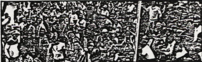
Striking mineworkers. The Chamber's last-minute wage offer came too late to stop them downing tools

Num held strike ballots, although not legally required to do so. They did this to indicate to the mine bosses that a large majority of workers intend to take strike action unless their reasonable demands are met. Said Ramaphosa: "Of the 43 271 who voted in the ballots, only 207 op-