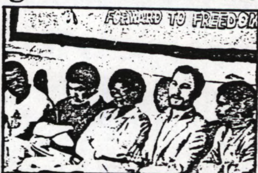
UDF executive members respond to Minister of Law and Order, Louis Le Grange's attacks