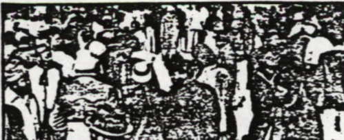
1980 - workers strike to stop 'Preservation Bill' the age of 65. In 1980 the government tried to pass a law preventing workers withdrawing money from pension funds before retirement age. It did so

PERSUADING African workers to save up for their own pensions has not been easy. There are too many things about the system they don't like. • African pensioners who received a private pension of just R40 a month would not get a cent from the government. • Employers and insurance companies invest pension money in things like office blocks and hotels to make profit. But most workers only get between two and five percent interest on their contributions. • The government has the power to put 53 per cent of all pension money into areas like bantustan govern-