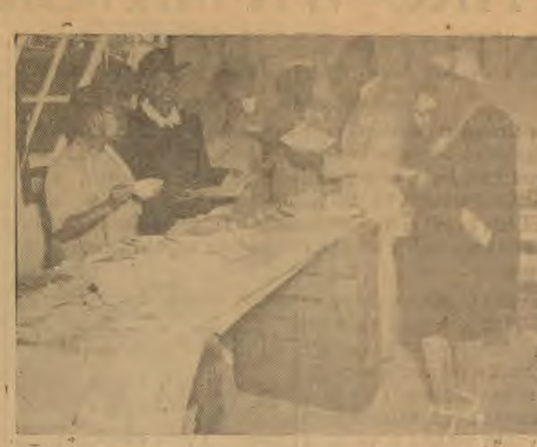
Bahloli le balekoli ba ikhatholla ka tse mosebetsing ea bona o moholo.