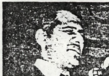
Advocate Zac Yacoob