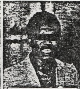
Mr. Popo Molefe