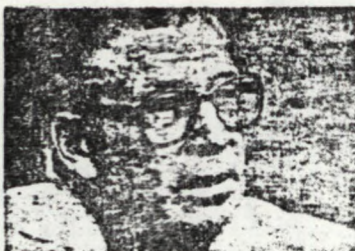
Rev. Dr. Beyers Naude